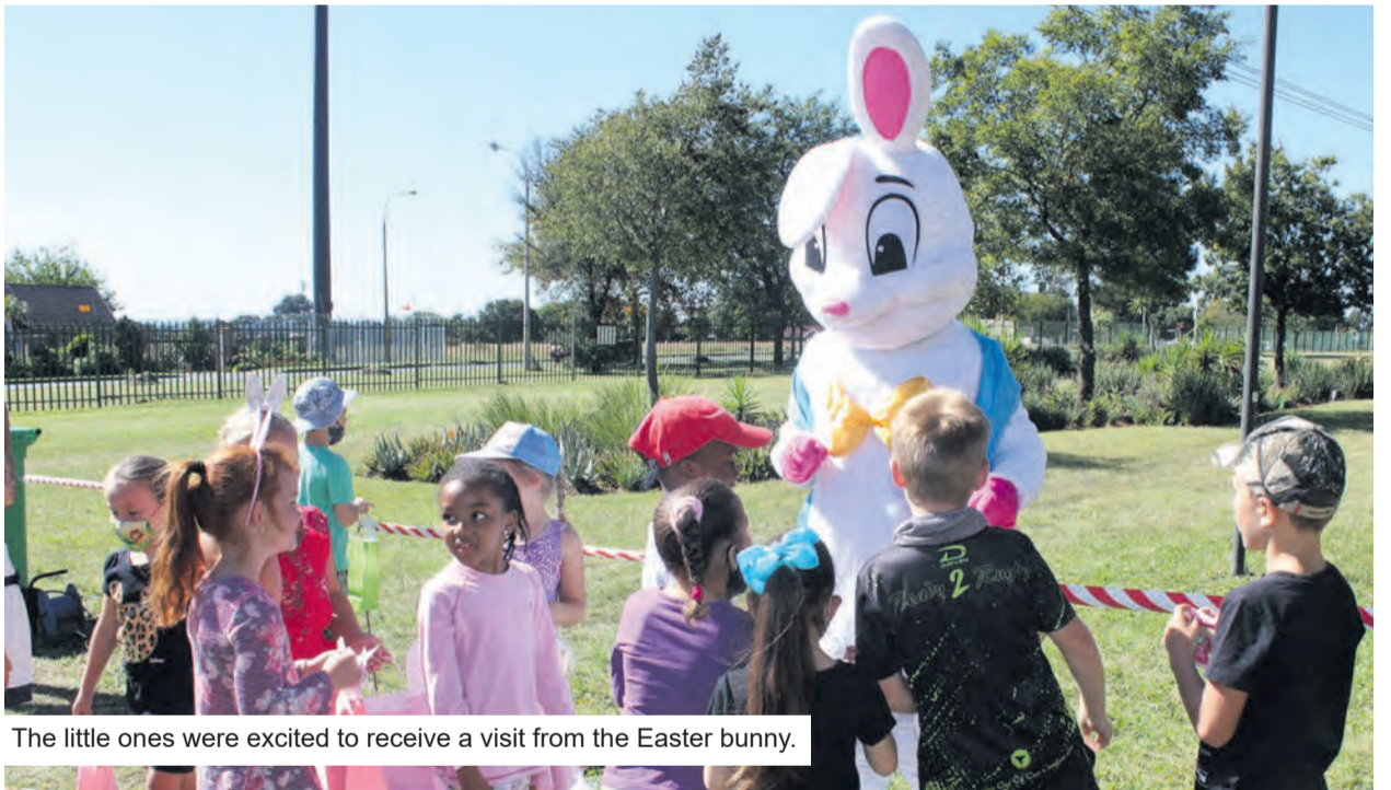
The little ones were excited to receive a visit from the Easter bunny.