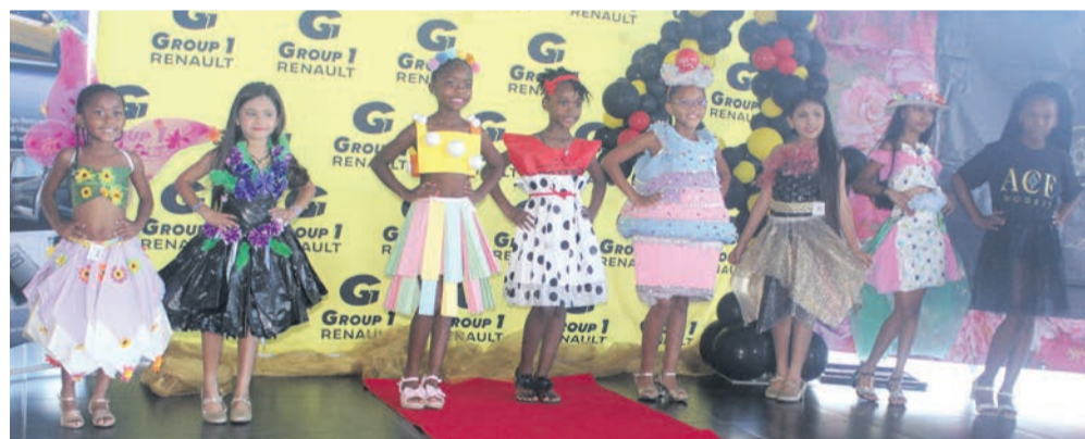
Ace Models Jhb South.