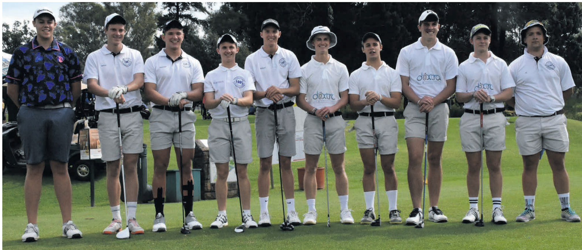
Hoërskool Marais Viljoen High's skoolspan tydens hulle jaarlikse gholfdag.