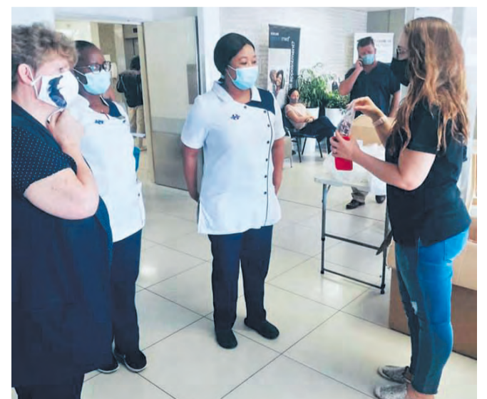
Packages being handed over to the staff of the Netcare Union Hospital.

at the Netcare Union Hospital, thank you for all your hard work, dedication, long hours and love over the past year that you have shown our community. We