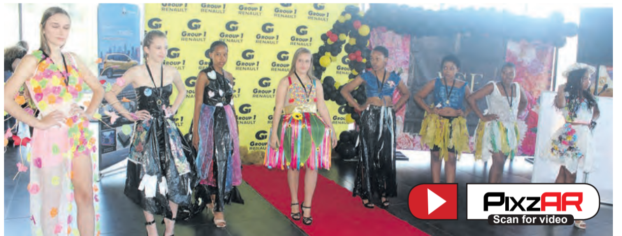
Ace Models Jhb South impressed the judges