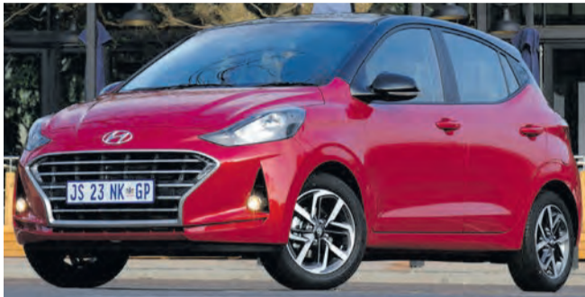
An all-new, fresh version of Hyundai's biggest seller in South Africa has arrived, the Grand i10.

The 1-litre Fluid version comes with a 14-inch alloy wheel, and the 1.2-litre flagship Fluid derivatives sport 15-inch alloy wheels with a