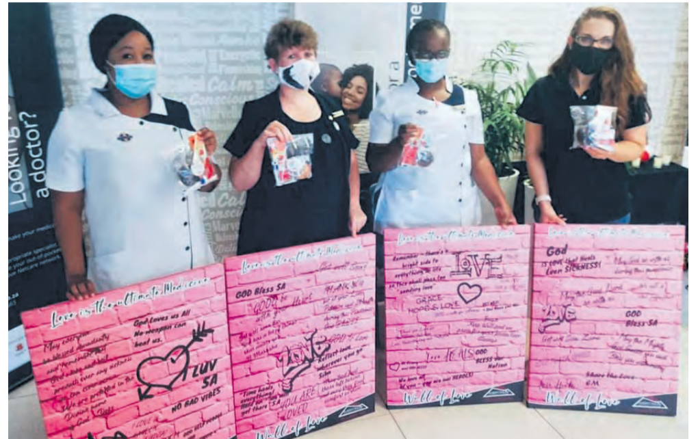
Frontline workers with the Wall of Hope messages from Alberton City Shopping Centre.