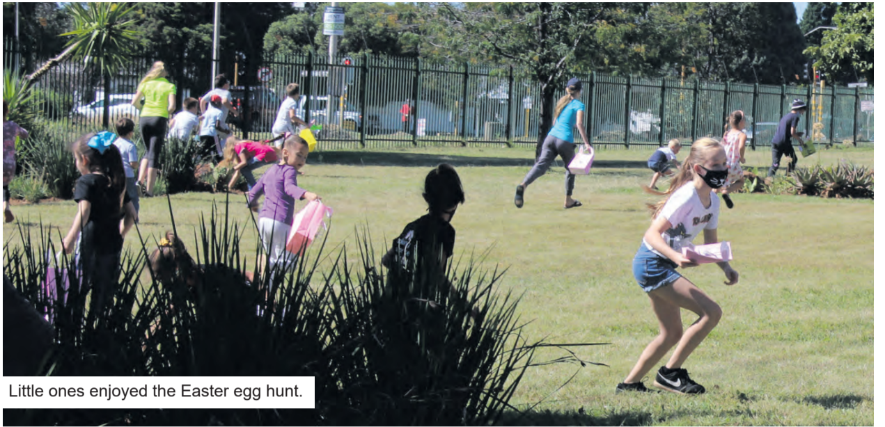
Little ones enjoyed the Easter egg hunt.

Among many other vendors on the day were OMFG Foodtruck, Habibi Properties, FFD Laser, Candy'z Arts, Adelicious Coffee, Penny Whistle Bead and Wire and Martins Academy.