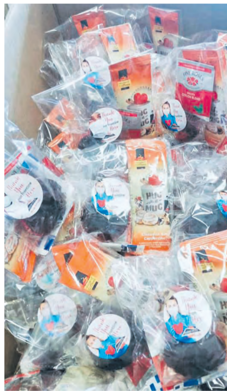
250 packages of appreciation.