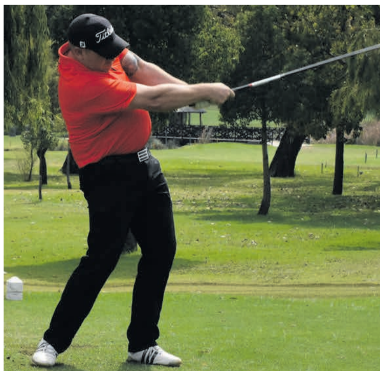
Gholfspelers het op 30 Maart bymekaar gekom om Hoërskool Marais Viljoen High se gholfdag by te woon.